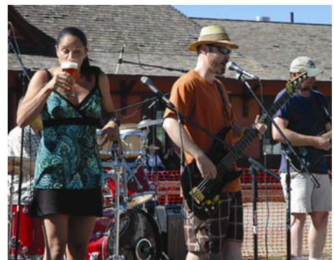
2008 Rails-To-Ales Brewfest entertainment performing in front of the restored Depot.

For more information and photos, visit the Cascade Rail Foundation's website at www.milwelectric.org